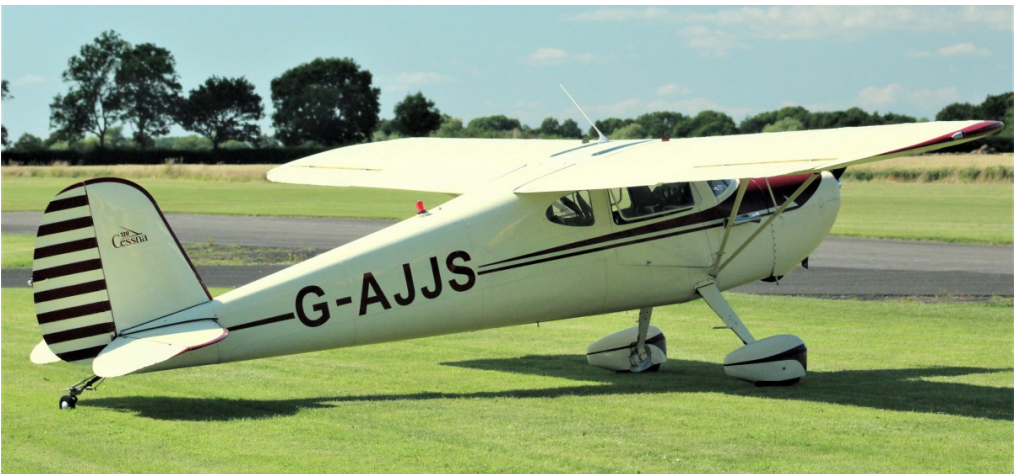
G-AJJS Cessna 120