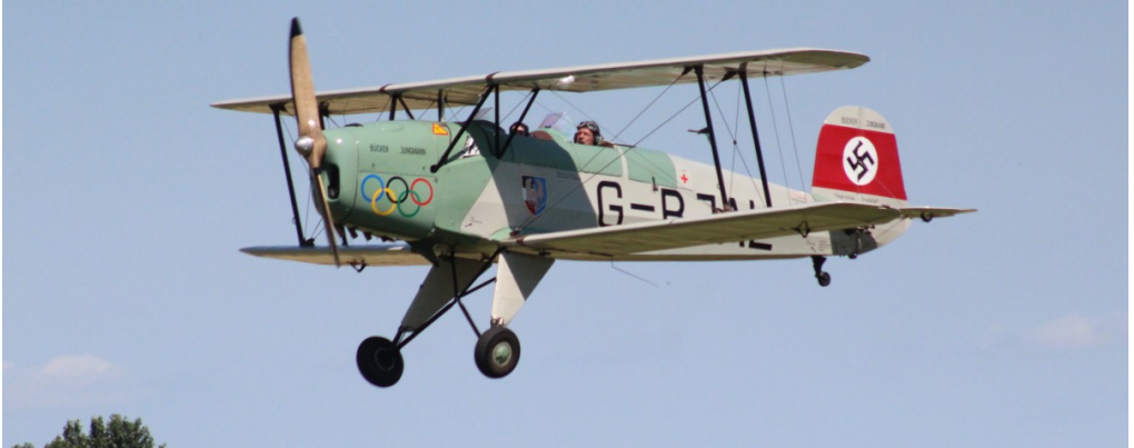
G-BJAL CASA 131E Jungmann