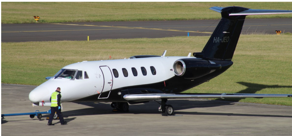
HA-JEO Cessna 650 Citation III 04/11 Ian Gratton

Dassault Falcon 8X 3A-MGA arr 09:48 dep 10:19 ret LBA at 14:49 n/stop, VAN's RV-6 G-BZVN arr 11:26 dep 14:57, Dassault Falcon 50EX M-ODUS arr 11:35 n/stop, Cirrus SR22 N220AD dep 12:15, Cessna 525B CJ3 D-CGER dep 13:02, Cessna 560 Excel CS-DXS arr 16:45 n/stop, Learjet 60 D-CFAZ arr 16:54 dep 19:30, PA-28-140 Cherokee G-LFSI arr 17:02 n/stop, Cessna 525A CJ1 D-IQQQ arr 18:30 n/stop