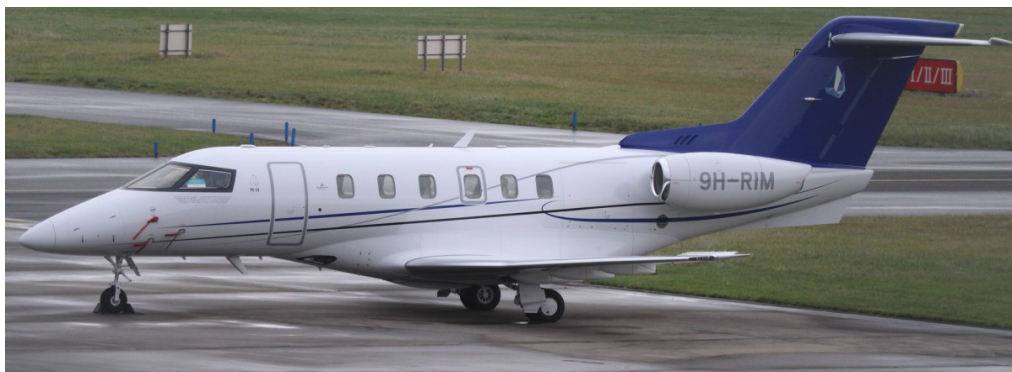
9H-RIM Pilatus PC-24 24/11 Ian Gratton

Cessna 525B CJ3 OE-GRA arr 09:30 dep 15:35, Beech 200C Kingair G-NIAB arr 10:13 dep 12:41, Cessna 560 Excel G-NJAC arr 11:55 dep 15:06, Global Express C-GLXM dep 13:11, Pilatus PC-24 9H-RIM dep 17:48