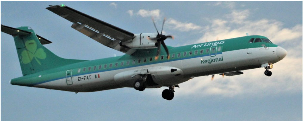
EI-FAT ATR72-700 Emerald 02/11