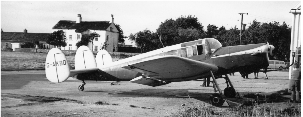
G-AKBO Miles Messenger Sherburn c 1960's