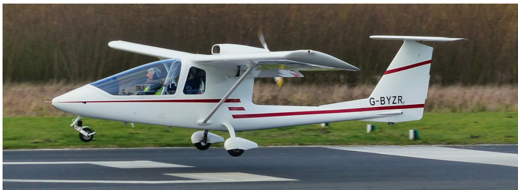
G-BYZR Sky Arrow 950 12/11