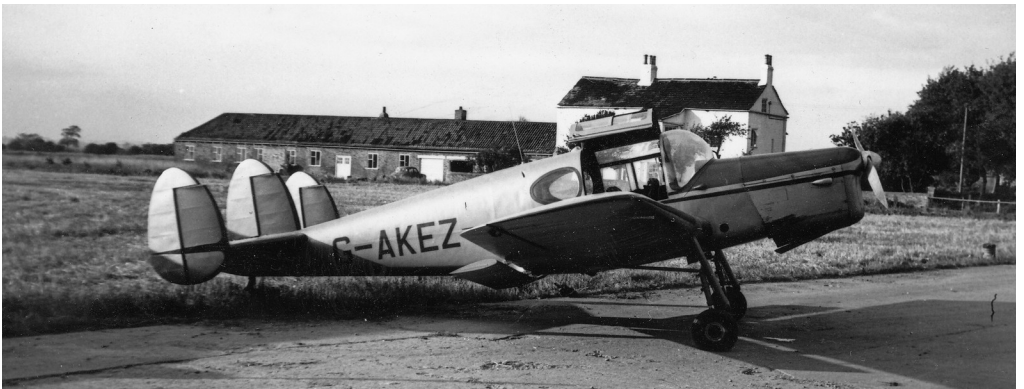
G-AKEZ Miles messenger Sherburn c 1960's