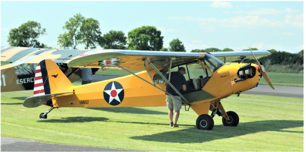
16037 (G-BSFD) Piper Cub