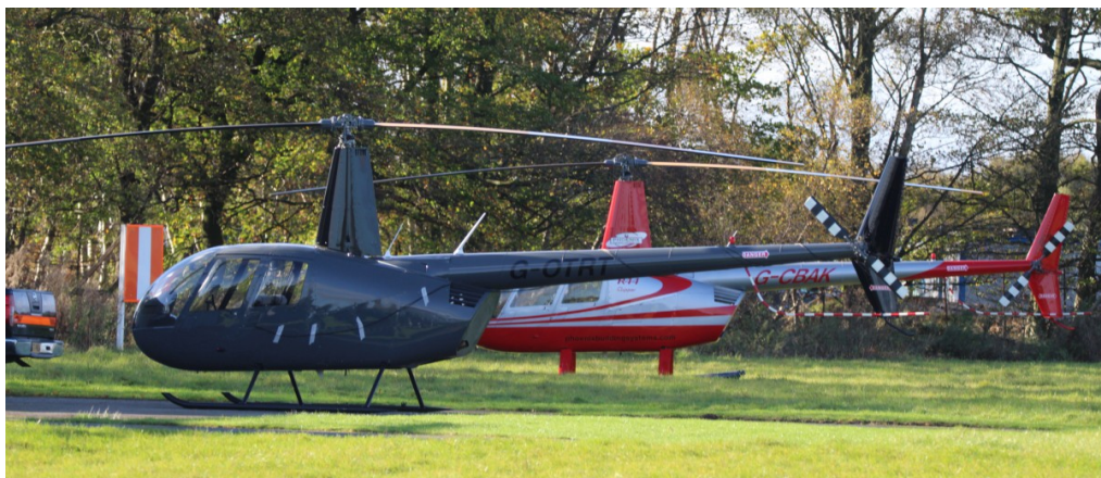
G-OTRT/G-CBAK Robinson R44 Ian 4/11 Gratton