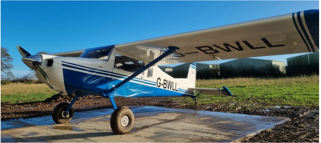
G-BWLL Murphy Rebel