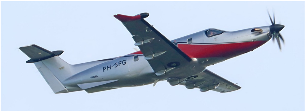
PH-SFG Pilatus PC XII 04/11 Paul Whincup