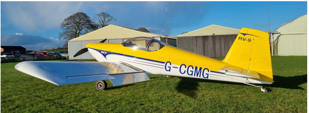
G-CGMG Vans RV-9