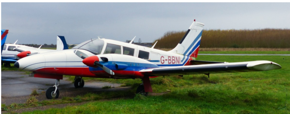
G-BBNI PA34 22/11 Seneca