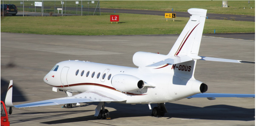
M-ODUS Dassault Falcon 50EX 04/11 Ian Gratton