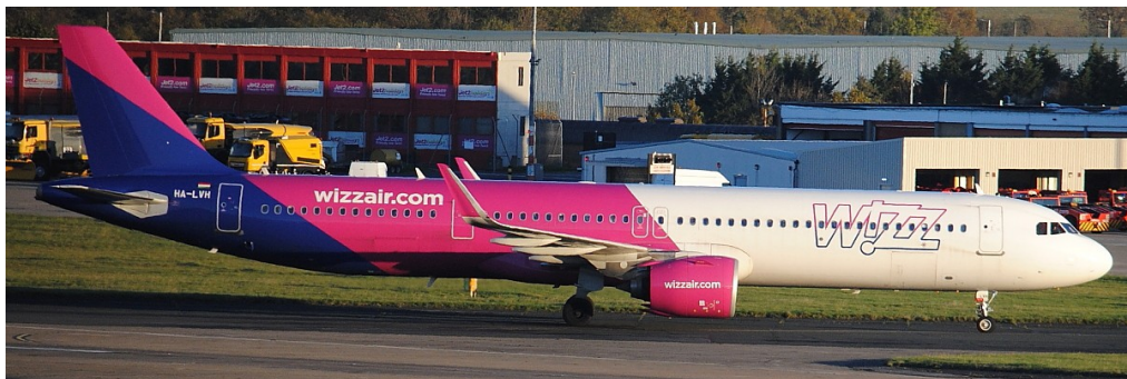
HA-LVH Airbus A321 Wizz 04/11