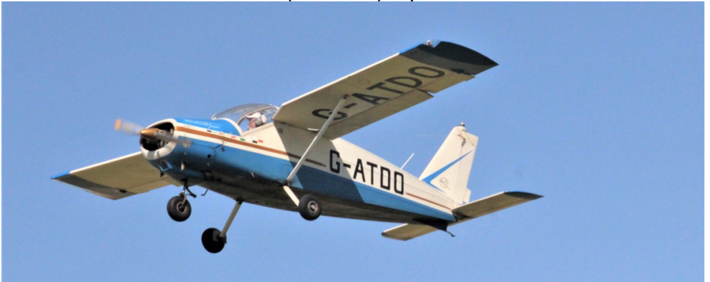
G-ATDO Bolkow Junior