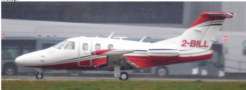
2-BILL Eclipse Ea500 18/11 David Wooler

Eclipse Ea500 2-BILL arr 08:29 dep 10:19, Cirrus Sr22 N575PW arr 10:14 n/stop, Phenom 300 G-VUYK arr 12:13 dep 12:52, Eurocopter EC145 (really MBB BK117) G-TAJB arr 13:43 dep 15:18, Beech 200C Kingair G-NIAB arr 13:49 dep 14:08, Cessna 550 Bravo G-IPLY arr 17:59 n/stop.