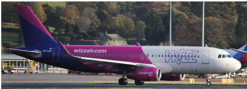
HA-LWZ Airbus A320 Wizz 01/11

Wroclaw (1815/1816, "4676/9737", Sun/Wed):-4/11 HA-LTF, 7/11 HA-LXT, 11/11 HA-LXG, 14/11 HA-LXT, 18/11 HA-LXM, 21/11 HA-LXM, 25/11 HA-LTB, 28/11 HA-LXM.