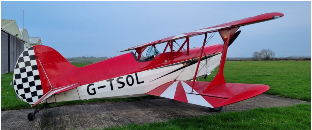
G-TSOL Acro Sport