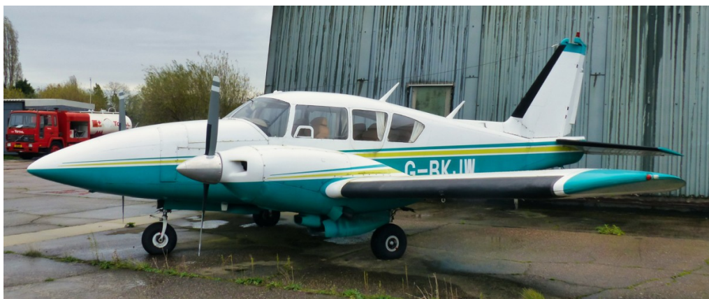
G-BKJW PA23 Aztec 05/11