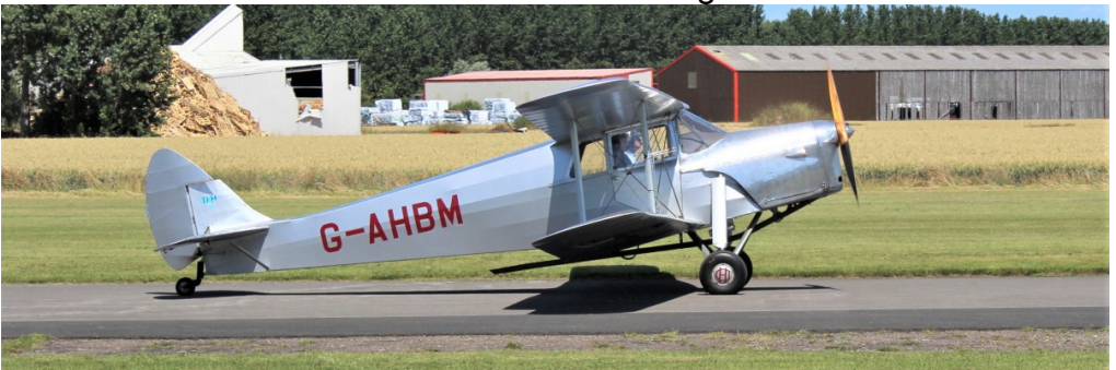
G-AHBM DH87 Hornet Moth