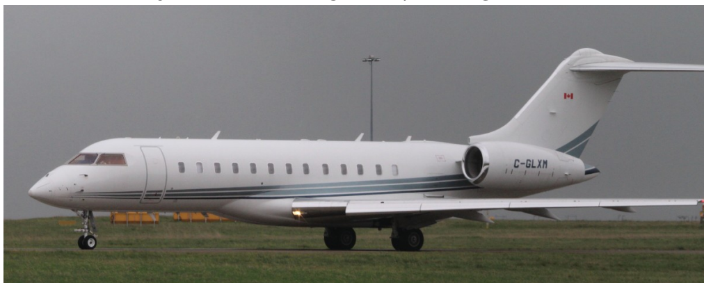
C-GLXM Global Express 24/11 Ian Gratton