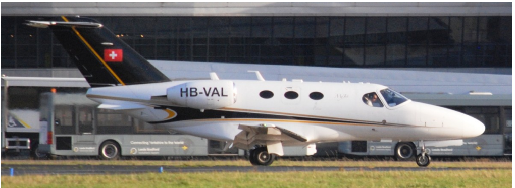
HB-VAL Cessna 510 Mustang 08/11 David Wooler

Global 6000 9H-VJI arr 06:33 n/stop, Cessna 510 Mustang HB-VAL arr 09:29 n/stop, Pilatus PC XII G-OTPL arr 14:13 dep 14:42, Sikorsky S-76C G-XXED arr 16:20 n/stop