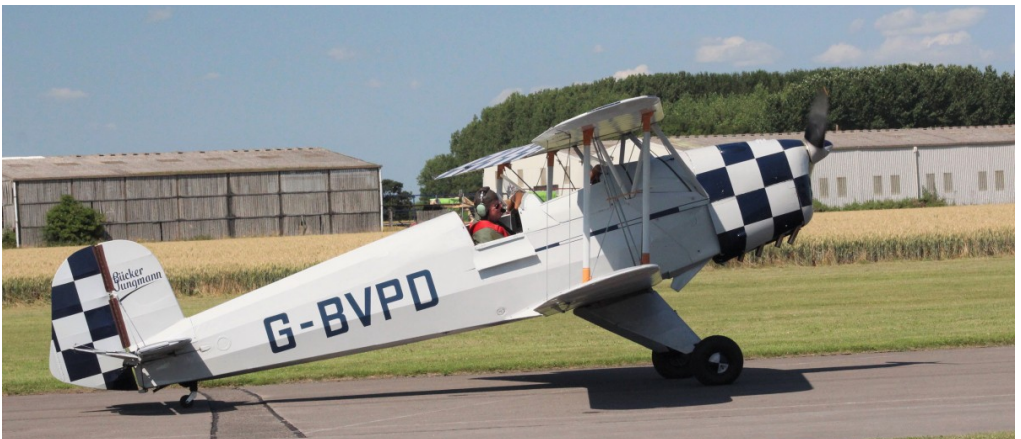
G-BVPD Bucker Jungmann CASA 1131E