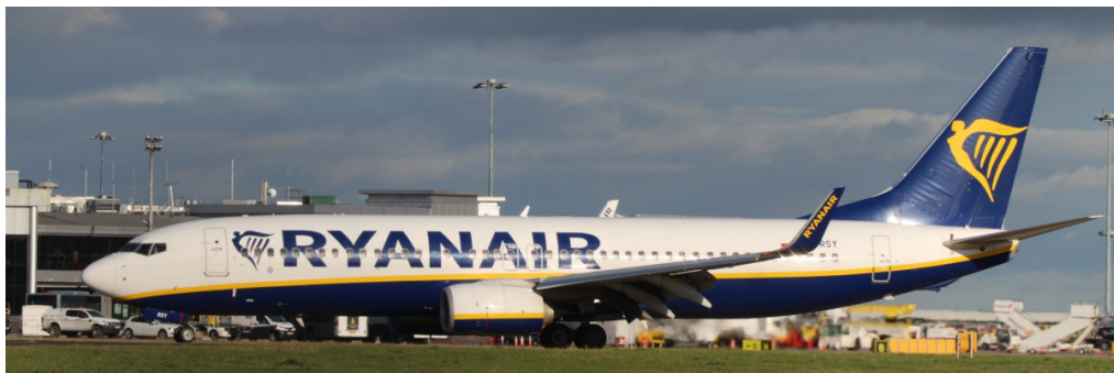
SP-RSY Boeing 737-8WL 04/11 Ian Gratton

Other flights :-6/11 SP-RKI(32P) positioned in from Manchester, 15/11 SP-RZF(320P) positioned in from Manchester, 28/11 SP-RSA(71P) positioned in from Liverpool, 29/11 SP-RKS(030P) positioned out to Wroclaw.