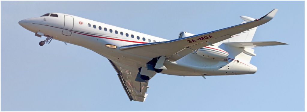
3A-MGA Dassault Falcon 8X 04/11 Paul Whincup