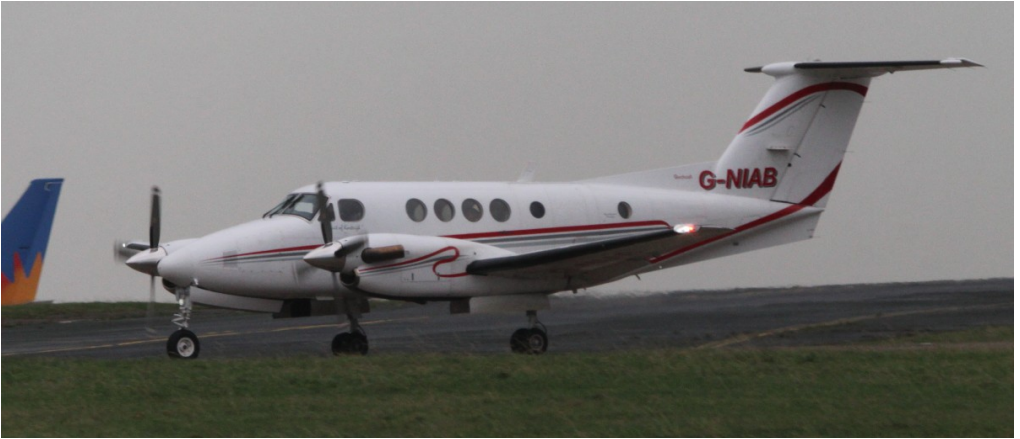
Beech 200C Kingair G-NIAB Woodgate 24/11 Ian Gratton

Partnavia P68 G-POLW dep 14:09 ret at 16:33, Cessna 560 Excel D-CDCM arr 14:22 dep 15:05,