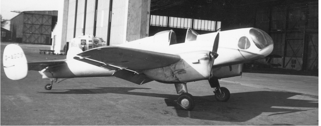
G-AGOS RSA Desford visiting Yeadon 1960's