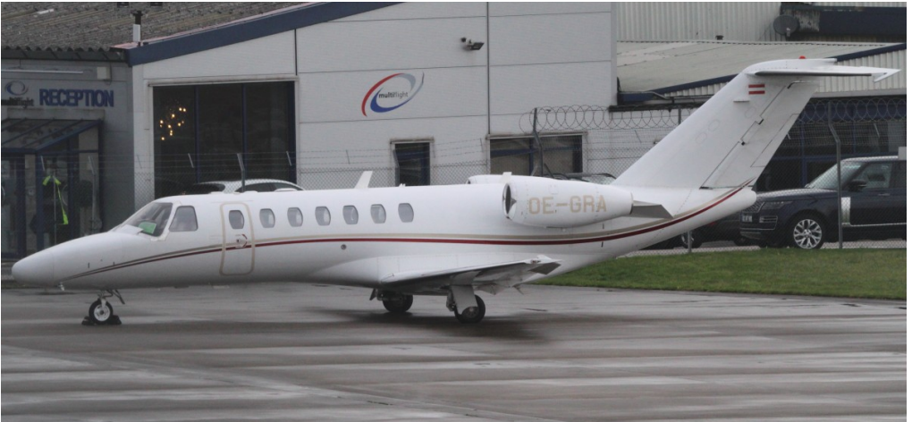
Cessna 525B CJ3 OE-GRA 24/11 Ian Gratton