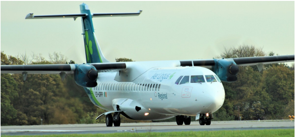
EI-GPP ATR72-600 Emerald 02/11