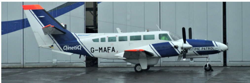
G-MAFA Cessna F406 15/11